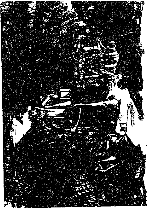
An engraving showing the hold of the slave ship Gr . During their trip to the World slaves were often forced to remain in cramped quarters with little food and water.